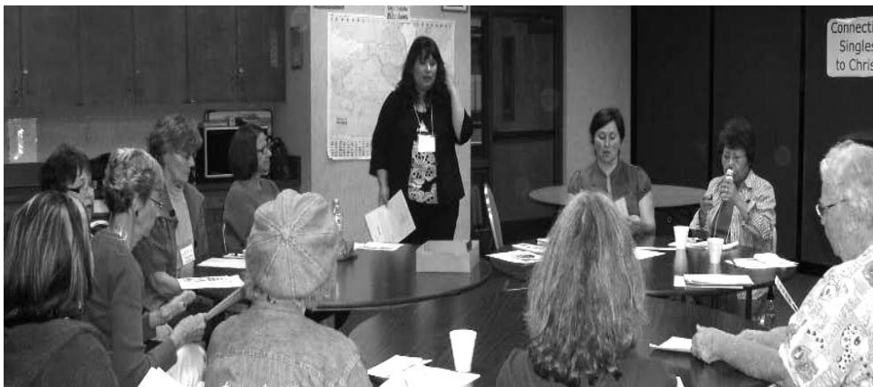
June 11, 2011, Care Partners Meeting, at The Bridge

For more information: Call (877) 223-3801, visit their Website at www.youngparkinsons.org .